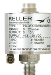
PD-41X Dimensions ø 50 x 62 mm

** Note that the error band will then increase proportionally