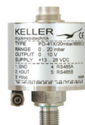
PD-41X Dimensions ø 50 x 62 mm

** Note that the error band will then increase proportionally