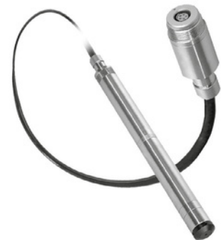
Version DCX-22SG DCX-22VG